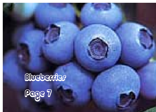
Blueberries Page 7