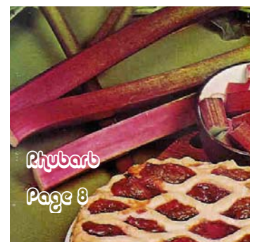
Rhubarb Page 8