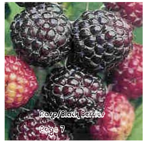
Rasp/Black Berries Page 7