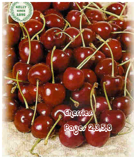
Cherries Pages 2,3,5,6