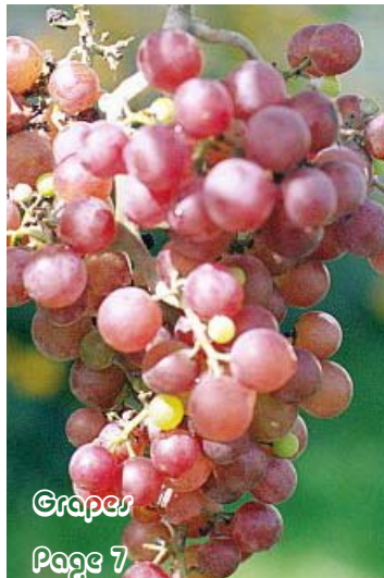
Grapes Page 7