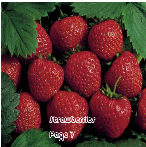
Strawberries Page 7