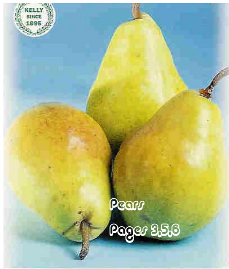
Pears Pages 3,5,6