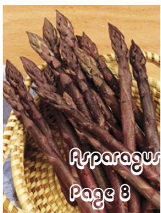
Asparagus Page 8