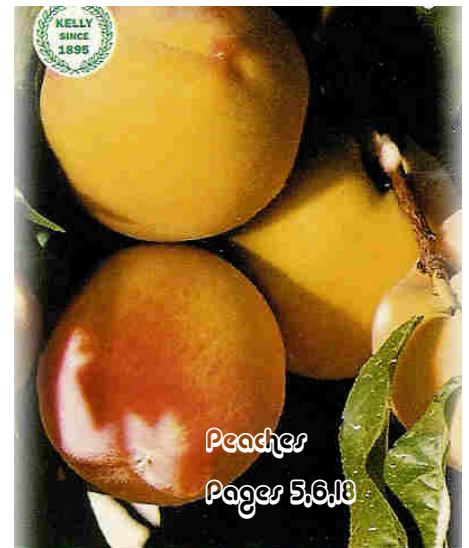
Peaches Pages 5,6,18